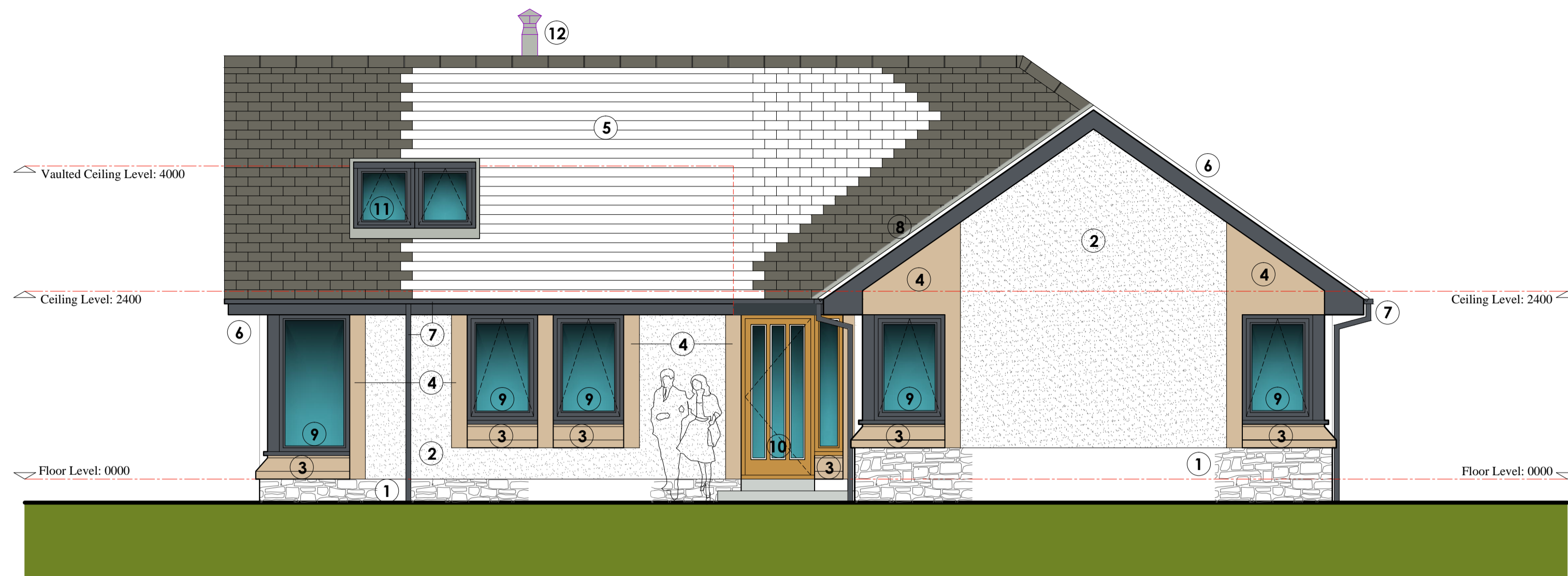
NORTH Elevation SIDE Scale : 1 : 50.